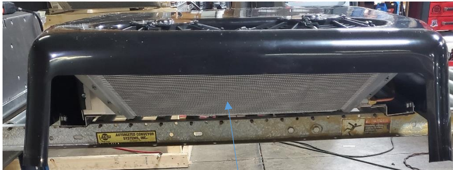
Condenser Coil View from Front of Vehicle

While driving down the road, over time, the condenser coil of your Turbo II can become partially clogged with dust, dirt, grease, and general road debris. Because of this it is necessary to periodically (once/yr) rinse out the coil with water. Important: Do not use high pressure water to clean the condenser coil. This can lead to damage of the aluminum fins on the coil which can lead to system failure. Use only normal water pressure from a typical garden hose. Simply rinsing off this dirt and debris will ensure maximum system performance.